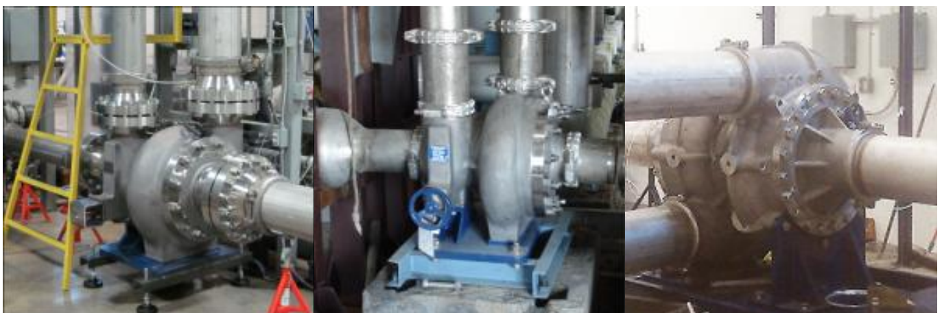
[5] 80+% transfer efficiency Upgrade 15% more efficient than competitor model